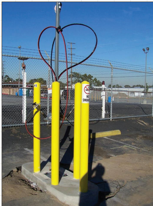
CNG fueling lines and parking spots where delivery vehicles can fuel while not in use.