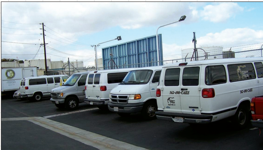
Rossmoor Pastries fleet vehicles parked next to CNG filling lines.

California is a proactive state and has multiple alternative fuel stations available for fleet fueling. Each fleet vehicle has a map of local CNG stations. Vehicles can travel about 180 miles before fueling. Each driver has a Clean Energy Credit card which can be used to fuel at public stations. However, Feder decided that an onsite CNG compressor station was more convenient and economical. The original compressor station could