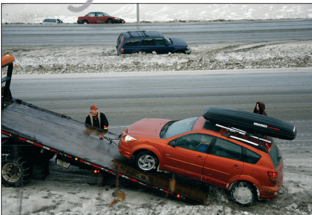
Figure 84: Flatbed tow trucks are commonly used in transporting alternative fuel vehicles.

It is the towing equipment operator's responsibility to assess the proper loading, tie-down and service procedure to be used in any given circumstance.