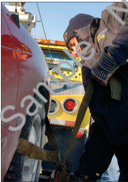
Figure 85: Wheel strap tie-downs are often recommended for securing the vehicle.