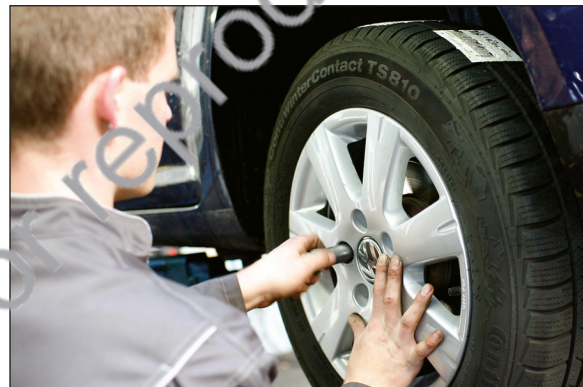
Figure 86: Not all alternative fuel vehicles have a spare tire.

Some alternative fuel or advanced technology vehicles may not have a spare tire (see Figure 86 ). Electric drive vehicles are usually equipped with an inflator kit, which is normally stored in a compartment on the driver's side of the rear cargo area. Follow the instructions provided in the kit. Always refer to Owner's Manual or the specific OEM Emergency Response Guide, usually available for download from the OEM website, for more information.