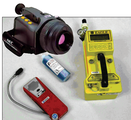
Figure 82: A thermal conductivity sensor, catalytic combustion sensor, or electrochemical sensor can be helpful in detecting an alternative fuel fire, as many of these fuels have flames that are nearly invisible.

pale blue flame is an excellent piece of equipment to have on hand to sense the presence of a hydrogen flame. If this is not available, the next best “tool” is a common straw broom (see Figure 83 ).